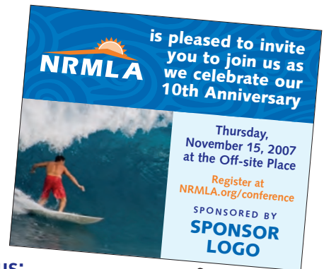
Sample concept only